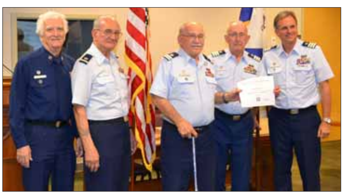
1st Place Flotilla Vessel Exams—with an average of 21 VSC's per examiner

Flotilla 3-10 and some of its members were well represented in the awards category.