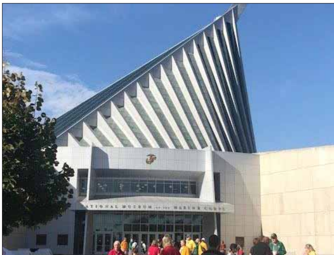
US Marine Corps Museum