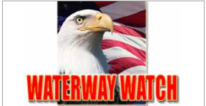
Practice and Preach . . . Maritime Domain Awareness and America’s Waterway Watch