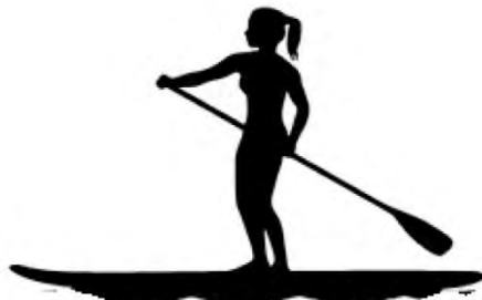
STAND UP PADDLE BOARD (SUP)