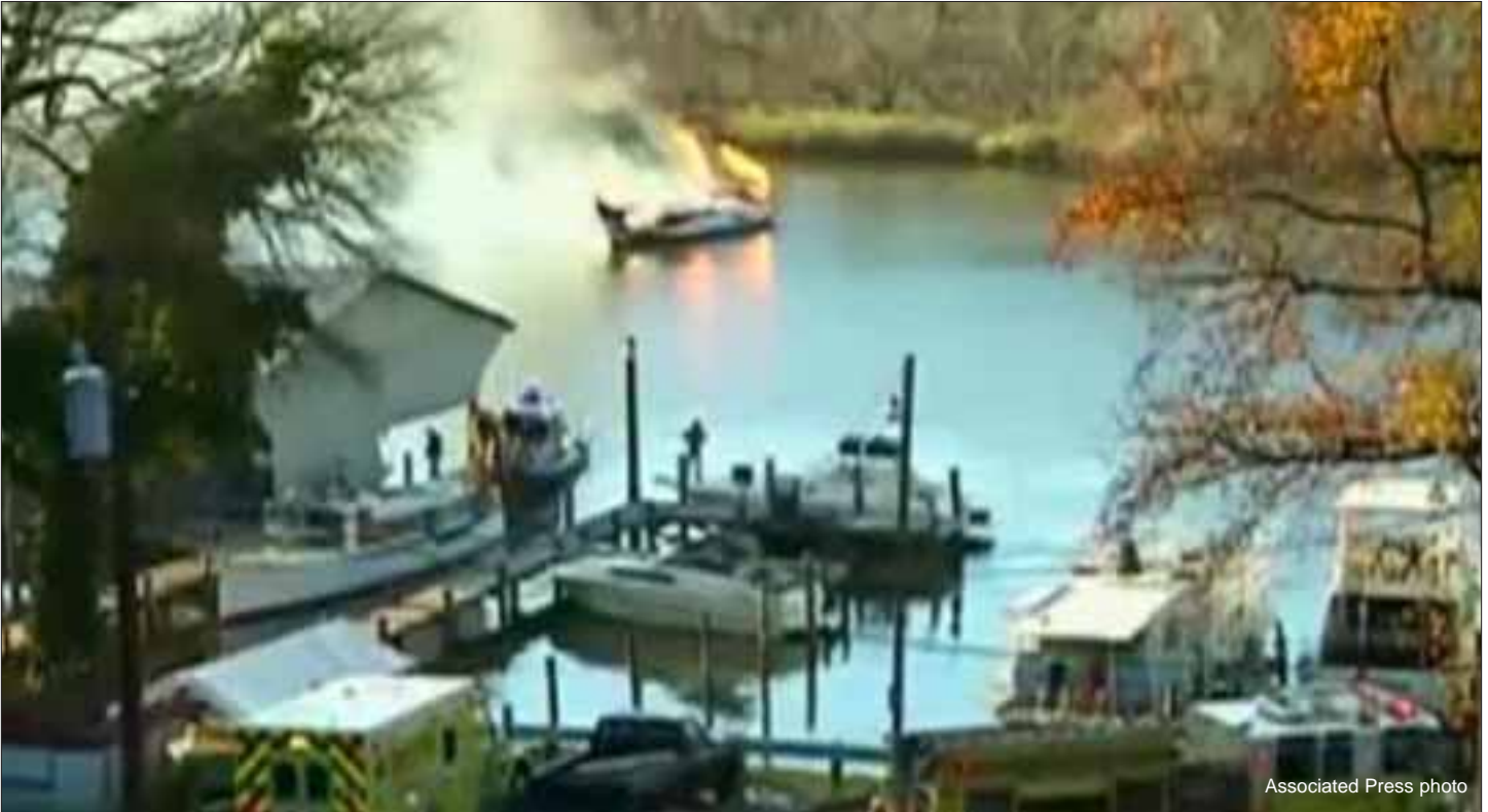
HENRICO, Va. (AP) -- Authorities say a fire at a Virginia marina has destroyed about a dozen boats. No injuries have been reported.

T he fire broke out Friday December 9th morning at the Richmond Yacht Basin along the James River in Henrico County, which surrounds the capital of Richmond.