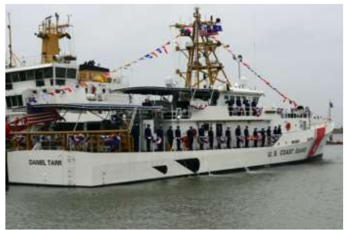
Coast Guard Cutter Daniel Tarr's crew members report for duty during the commissioning ceremony.

For their role in the landing of the Marines' first wave, and capture of Tulagi, the four coxswains were awarded the Silver Star Medal. They were the first enlisted men in the Coast Guard to receive the Silver Star Medal.