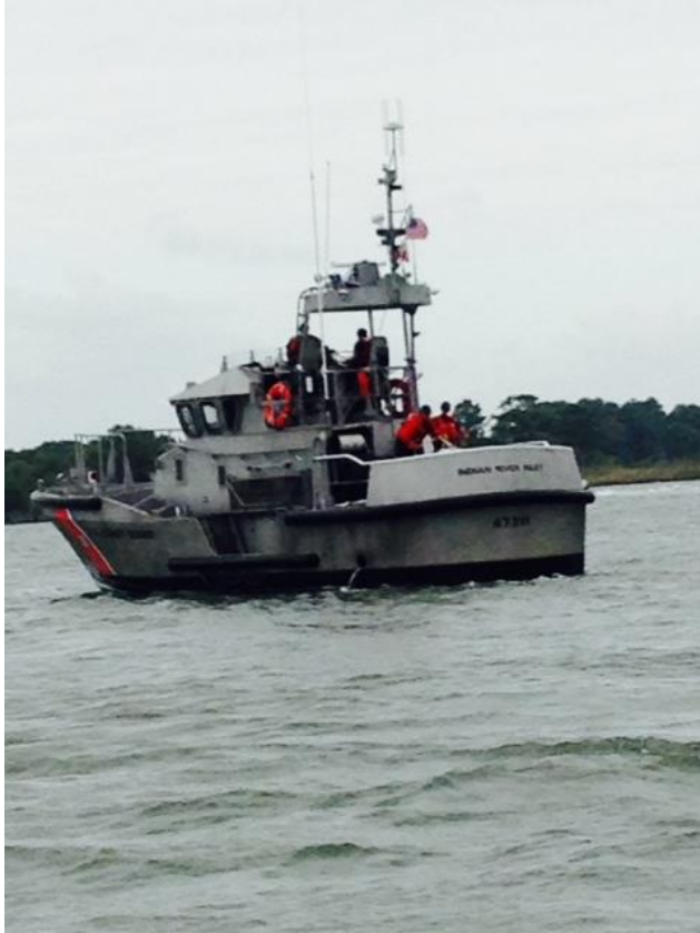
Coasties training too....

There are many members in Division with Facebook accounts that have not liked our page yet.