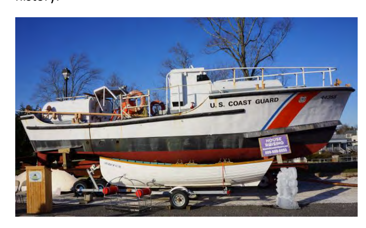
Coast Guard Motor Lifeboat 44355

The vessel was once located at the Beach Haven Coast Guard Station where it was used to rescue many stranded seafarers. Last year it was moved from its previous location at Bayview Park in Long Beach Township to the current site. It is now on a trailor but eventually will be moved closer to the water where it will be reassembled and given a fresh coat of paint. Visitors will be treated to an up close and personal visit to a piece of maritime history.