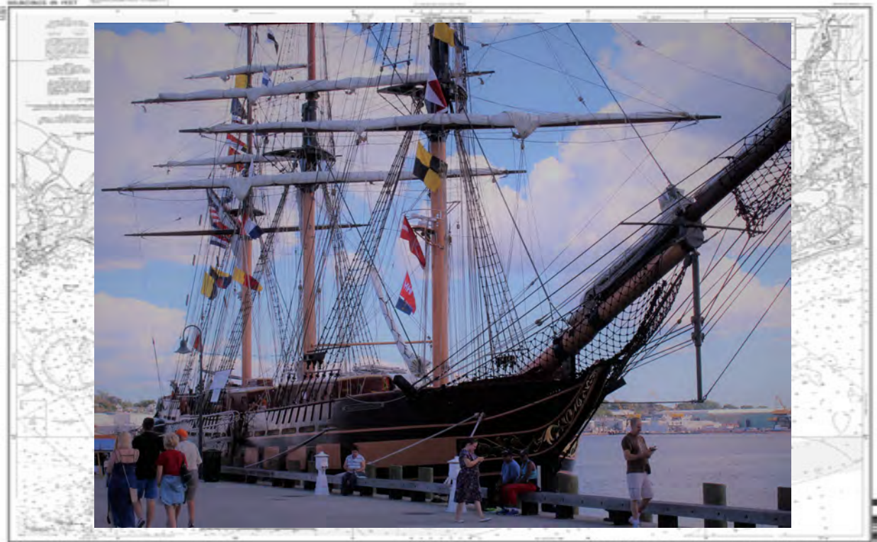
Tall ship the Oliver Perry Hazard from Newport, Rhode Island moored at New London City Pier