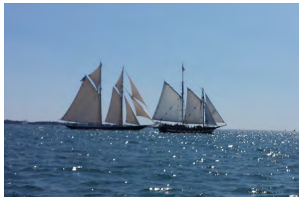
Schooner Columbia overtaking the Mystic Whaler