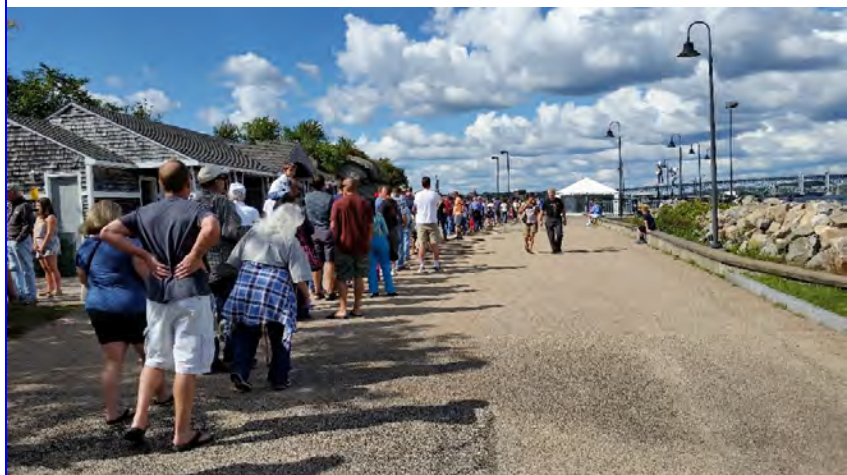
Admission line at fort Trumbull for the Coast Guard Cutter Thunder Bay and the USS Cole.

The weekend's centerpiece attraction was the Naval ship USS Cole, a 505-foot Aegis-equipped guided missile destroyer home ported in Norfolk, Virginia. The ship was moored at the Fort Trumbull Pier, where she was visited by over 6,000 people.