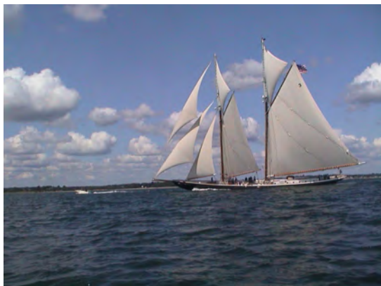
AUXFAC Sea Lion escorting Columbia