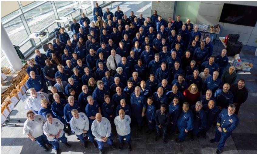
2024 D1SR Staff Officer College 20 Jan 2024