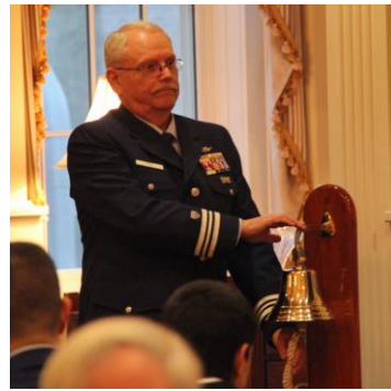
Bowen honoring our shipmates who have crossed the bar.