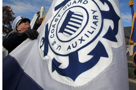
Bill Bowen, 25-03 assists in unfurling the Auxiliary flag prior to stepping off.