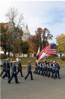
Team Coast Guard passing the State of Connecticut Capitol Building.