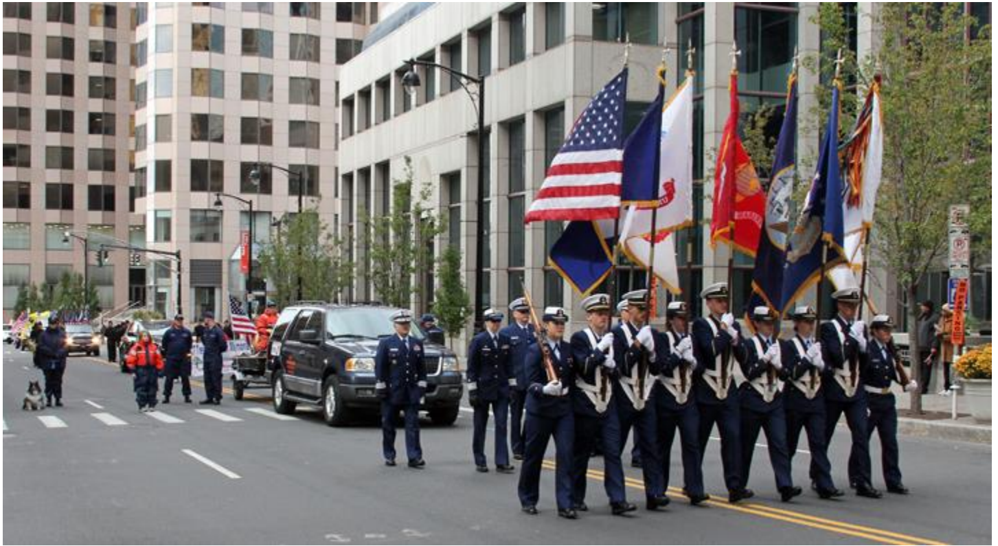
Team Coast Guard heading down Main Street toward the review podium.