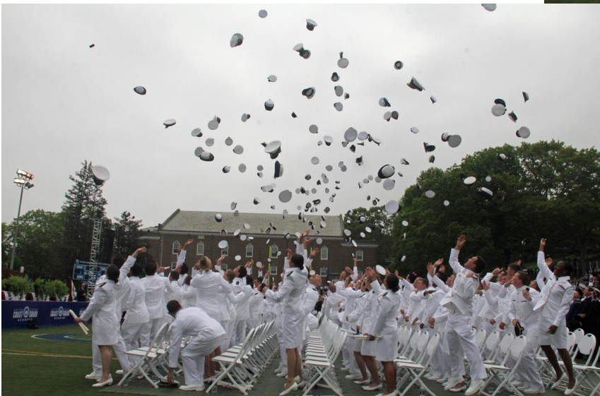
Newly commissioned ensigns toss their hats and shoulder boards in the air as they divest themselves of all symbols of cadet life. A long standing tradition is maintained as children run out to collect the hats and shoulder boards.