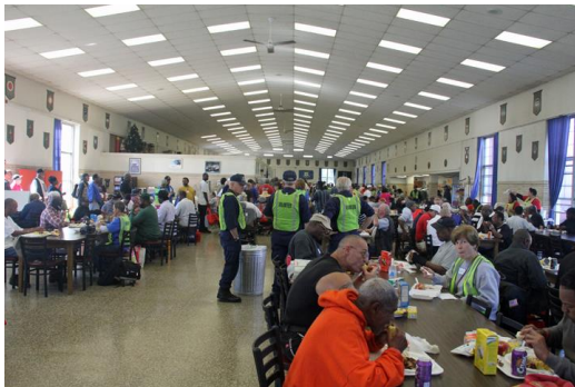
With almost 1000 lunches served, Auxiliarists stand ready to assist in the dining hall.