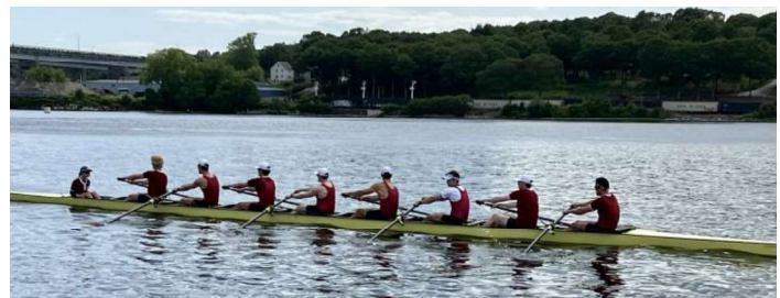
Right. Harvard crew warming up before their race.

The 29-foot response boat small II is a high-speed deployable asset designed to operate year-round in shallow waters along coast boarders. The missions of the small boats are search and rescue, recreational boating safety, enforcement of laws and treaties, marine environmental protection, defense operations, and port, waterways and coastal security.