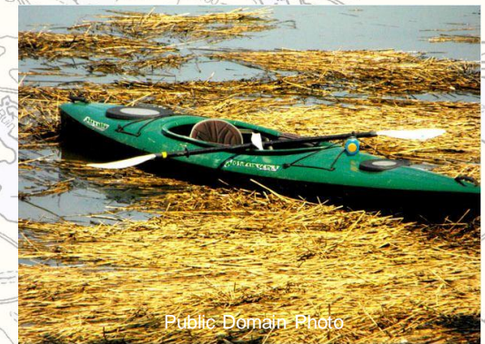
Public Domain Photo